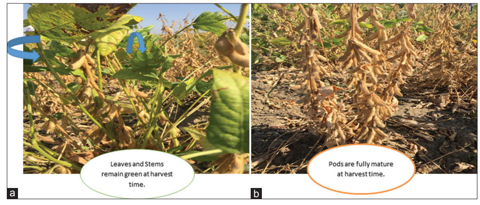
Fig 2. (a) GSS observed soybeans; (b) Non GSS observed soybeans

The data obtained in the study were subjected to variance analysis using a statistical package program. Parameters