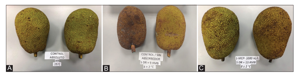
Fig 2. Color analysis of jackfruit peel: (A) absolute control stored for 8 days; (B) control stored at 8°C for 14 days; (C) treatment with 1-MCP 1000 nL L-1 stored for 18 days.

days 17 and 18; when the values were close to those of the absolute control fruit (28.48%, 27.50%, and 26.33%, respectively).